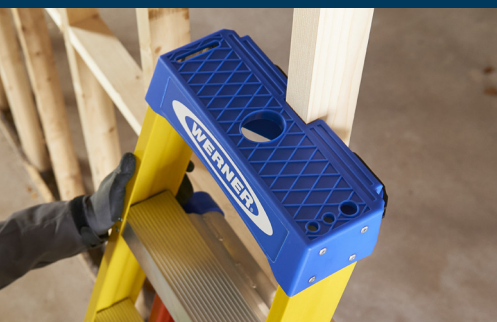
Unique top for corner, stud or pole leaning