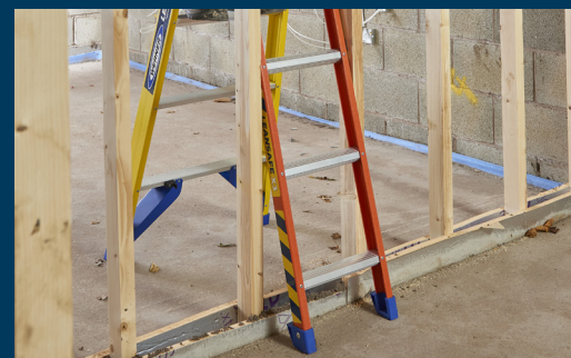
Compact rear section fits between framing studs